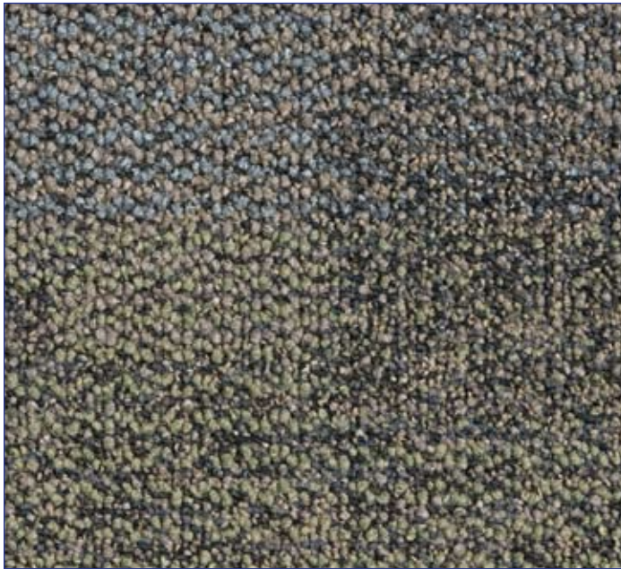
4109 Forest Floor 24"