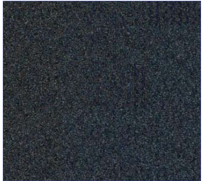
4110 Lake Tahoe 24"