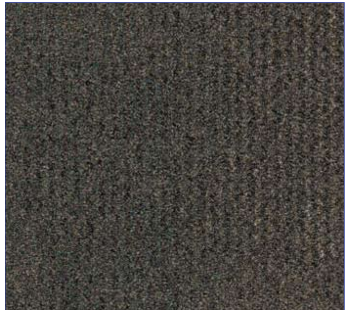
4112 Appalachian Trail 24"