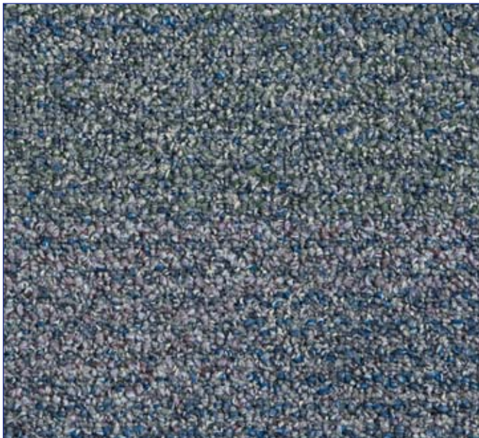
4111 Santa Fe Sunset 24"